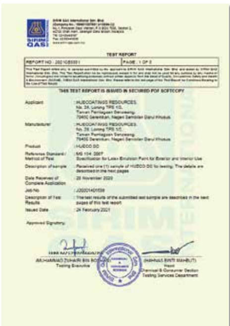
SIRIM TEST REPORT - HUECO SC