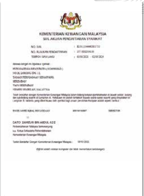
KEMENTERIAN KEWANGAN MALAYSIA