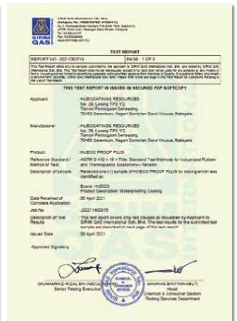
SIRIM TEST REPORT - HUECO PROOF PLUS