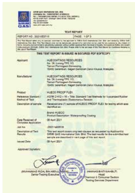
SIRIM TEST REPORT - HUECO PROOF FLEX